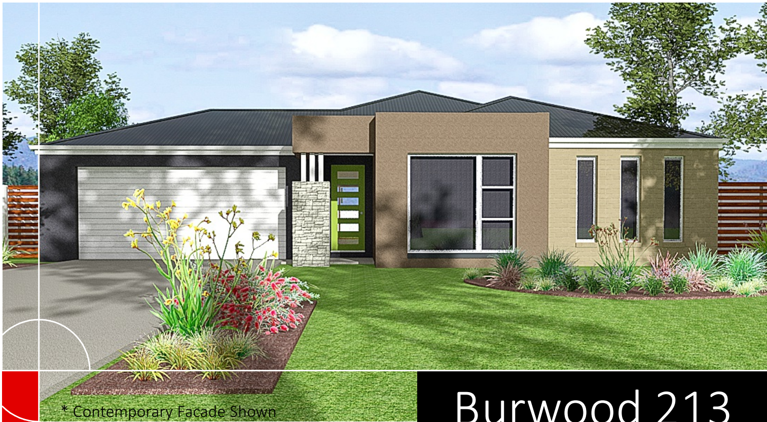
* Contemporary Facade Shown