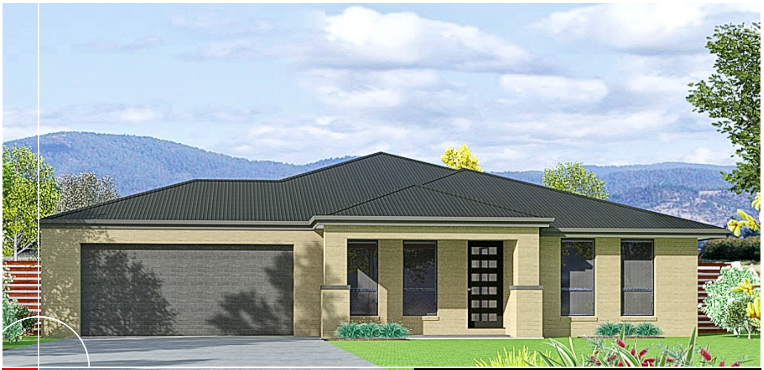
* Urban Facade Shown