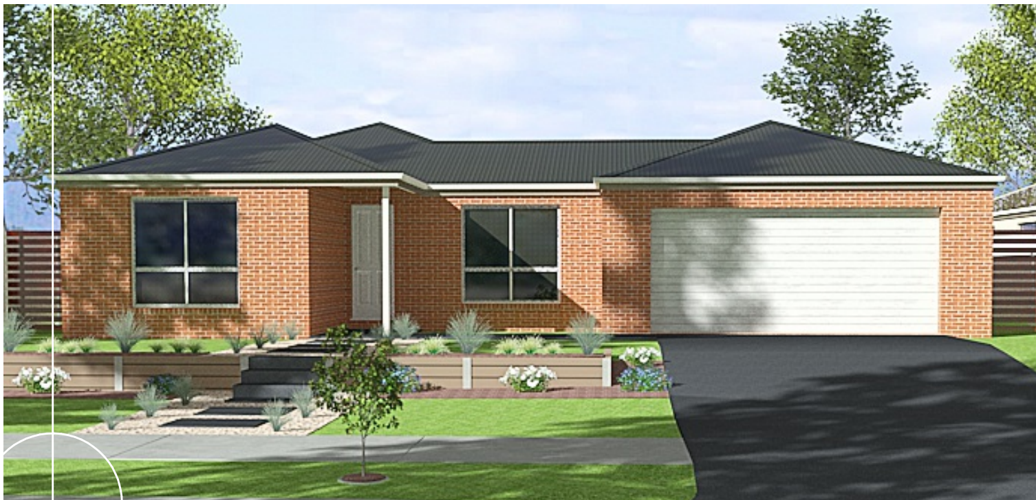
* Traditional Facade Shown