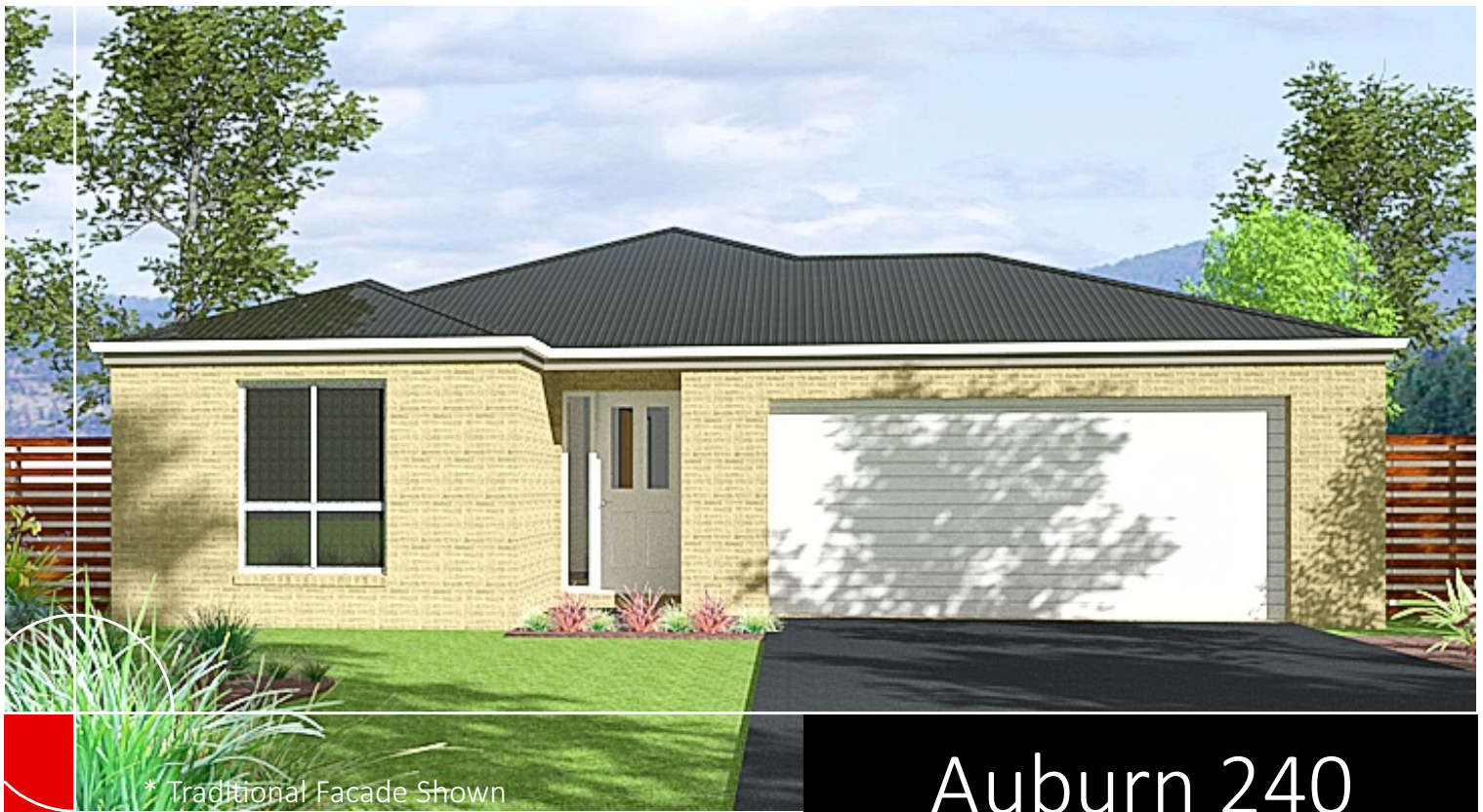
* Traditional Facade Shown